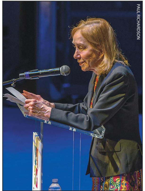
Doris Kearns Goodwin.