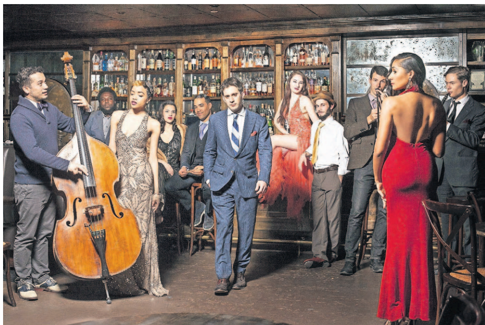
Postmodern Jukebox plays March 7 at Festival of the Arts BOCA. [JACKSONVILLE JAZZ FESTIVAL]