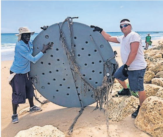
A drifting fish aggregating device, or FAD, found on Palm Beach in April 2019.